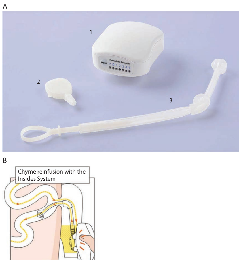
FIGURE 1. The Insides System ® : a novel stoma output reinfusion device. A, Three device components: (1) driver unit: handheld, portable, battery-operated, rechargeable; (2) impeller: compact, contains neodymium magnetic bar, placed within stoma appliance and connected to the proximal end of the feeding tube; and (3) custom enteral feeding tube: 24F, silicone, inserted into the downstream ileostomy limb. B, Diagram schematic of the system in situ. Depiction of magnetic coupling between the driver unit and impeller pump. Enteral feeding tube is located within the downstream ileostomy limb.

development of a custom tube specifically designed to overcome the shortcomings.